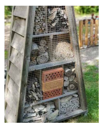
terials and paints etc.

The Swedish Allotment Federation's environment diploma programme started about 20 years ago and so far only 5 associations have managed to reach gold level. There are four levels, basic, bronze, silver and gold. The association as a whole has to maintain one level for a minimum of two years before applying for the next. If they don't maintain the reached level, they lose their diploma. The requirements include ecological gardening (composting, no pesticides etc), promoting biodiversity, water management, choosing environmentally friendly ma-