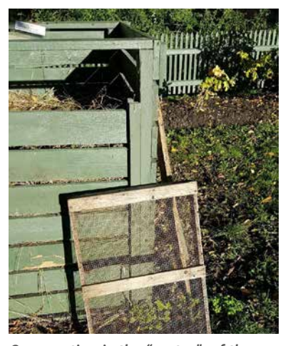
Composting is the "motor" of the gardening in Långholmen.