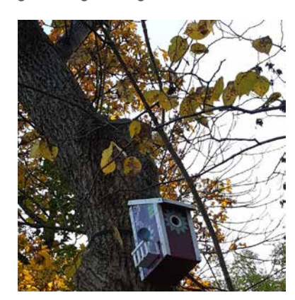
In the trees around the association's site you can admire many nicely painted birdhouses.