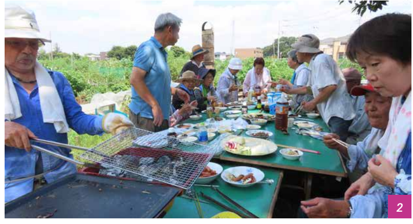
In August: A member makes a barbecue in which all can freely participate.

We, the members of the allotment garden federation of Japan, are most proud of this fact, that the allotment gardens constitute a beautiful community connecting people's hearts. The allotment gardeners can visit and freely spend their time on the allotments on the condition of respecting the basic rules of garden use. While gardening freely in their own way, they cooperate and support each other.