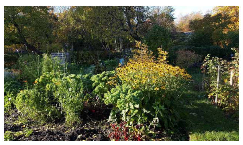
On Långholmen's allotment site you find a mixture of plots with and without cottages.

The Swedish Allotment Federation's environment diploma programme started about 20 years ago and so far only 5 associations have managed to reach gold level. There are four levels, basic, bronze, silver and gold. The association as a whole has to maintain one level for a minimum of two years before applying for the next. If they don't maintain the reached level, they lose their diploma. The requirements include ecological gardening (composting, no pesticides etc), promoting biodiversity, water management, choosing environmentally friendly materials and paints etc.