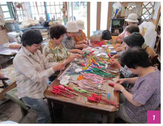
End of June: the members who love herbs, make a lavender stick.

president of the Japanese allotment federation